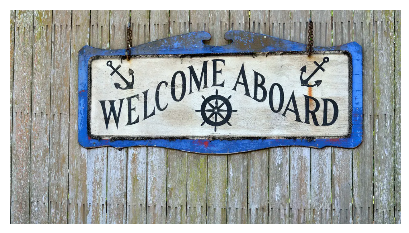
Synonyms of "Aboard" as an adverb (1 Word)