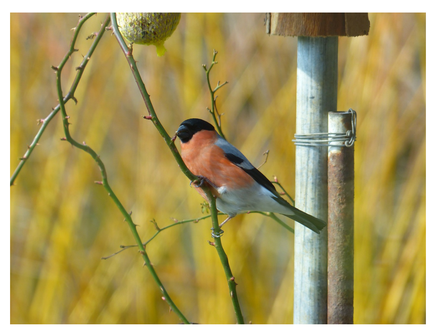
Usage Examples of "Actualize" as a verb

• He had actualized his dream and achieved the world record.