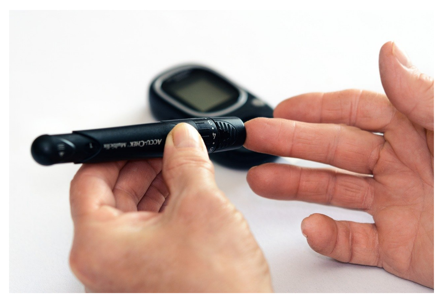
Usage Examples of "Ailment" as a noun

• The doctor diagnosed a common stomach ailment.