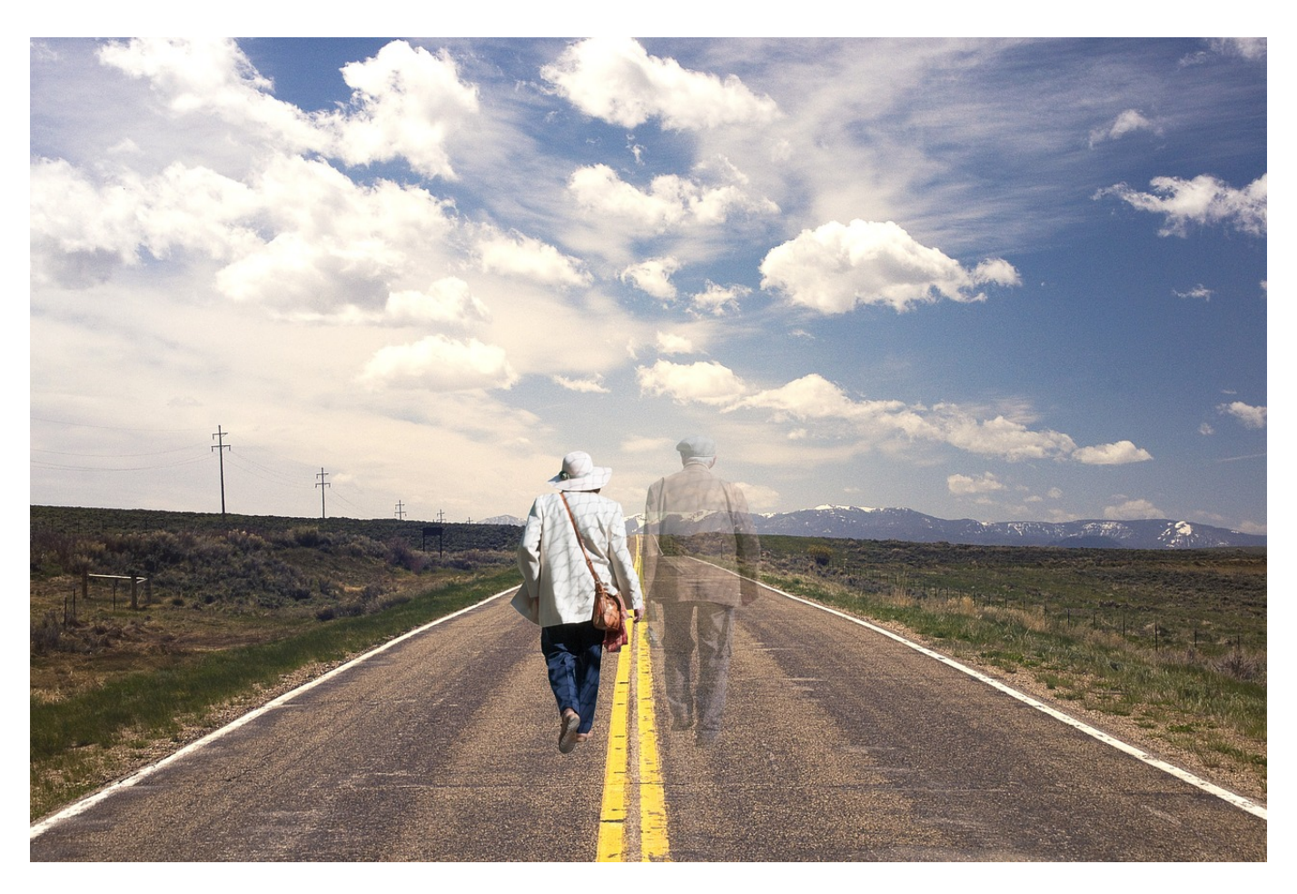
Usage Examples of "Allegory" as a noun

• Pilgrim's Progress is an allegory of the spiritual journey.