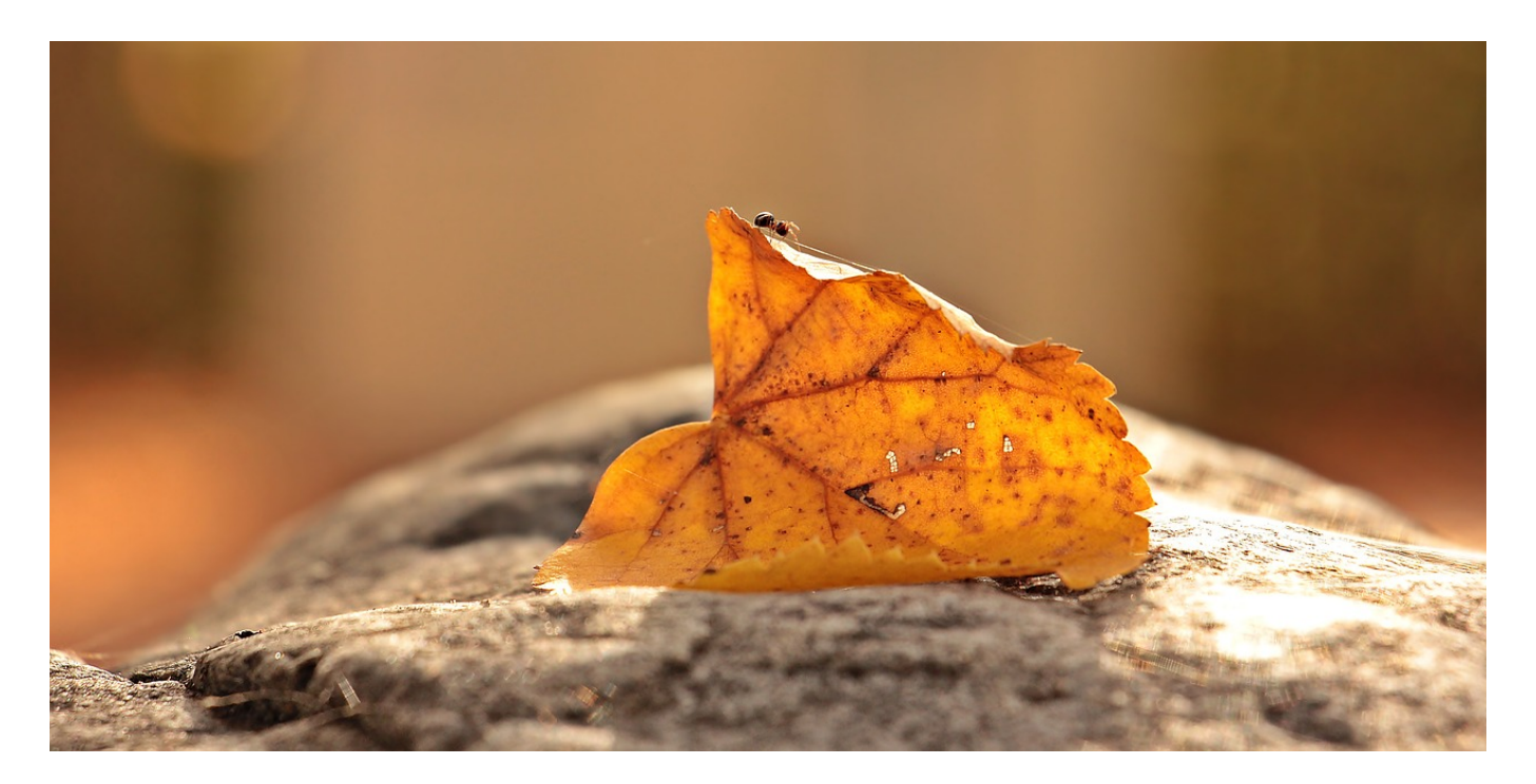
Usage Examples of "Ante" as a noun

• The antes were at the $10,000-$20,000 level.