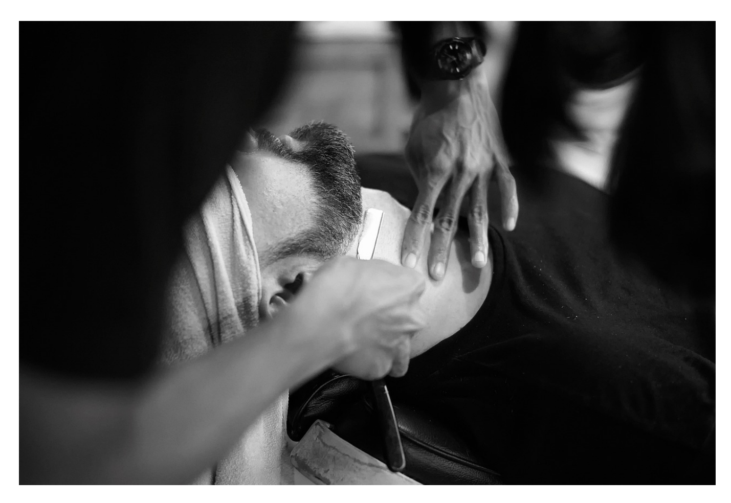
Usage Examples of "Barber" as a verb