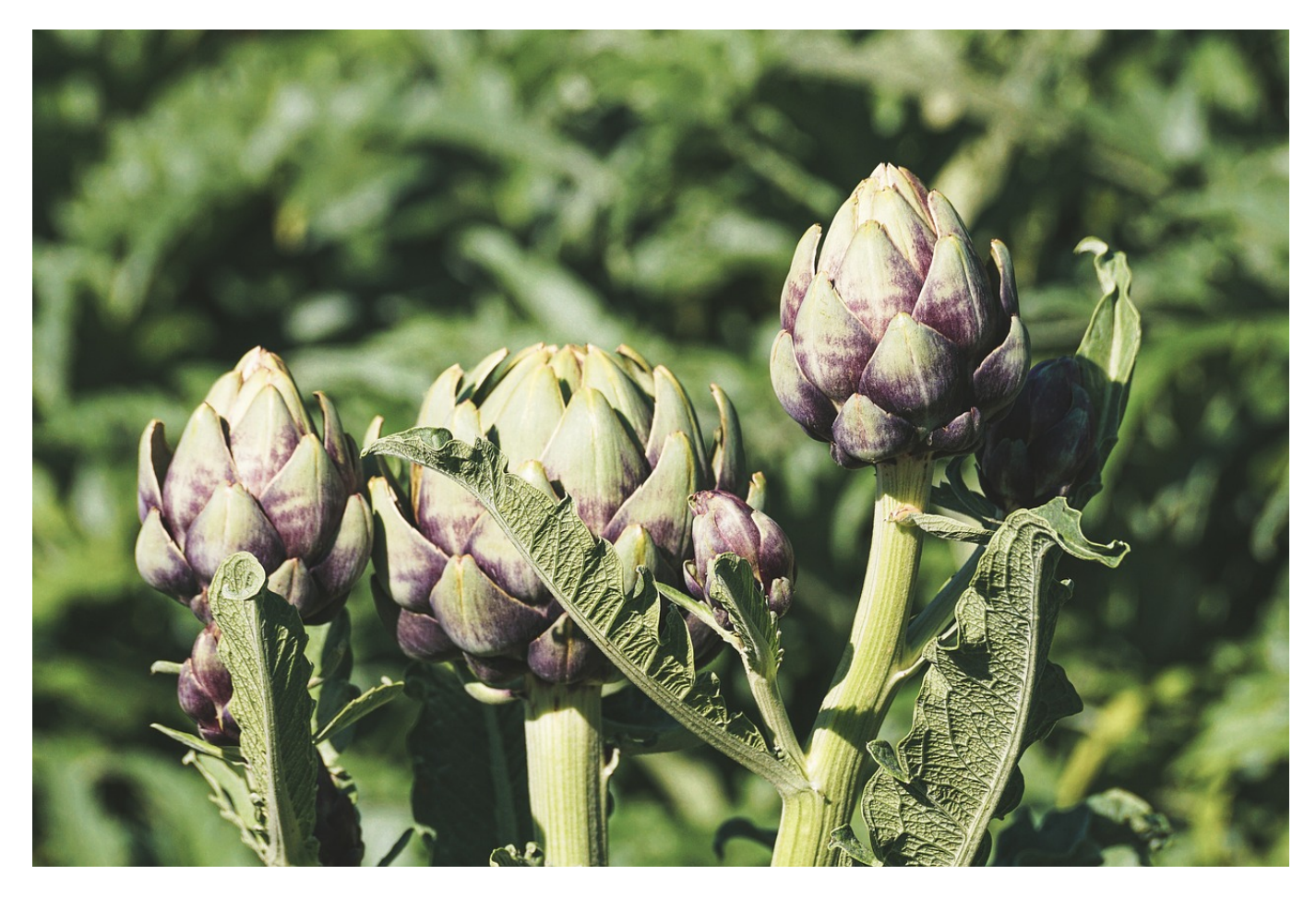
Usage Examples of "Bitter" as an adverb