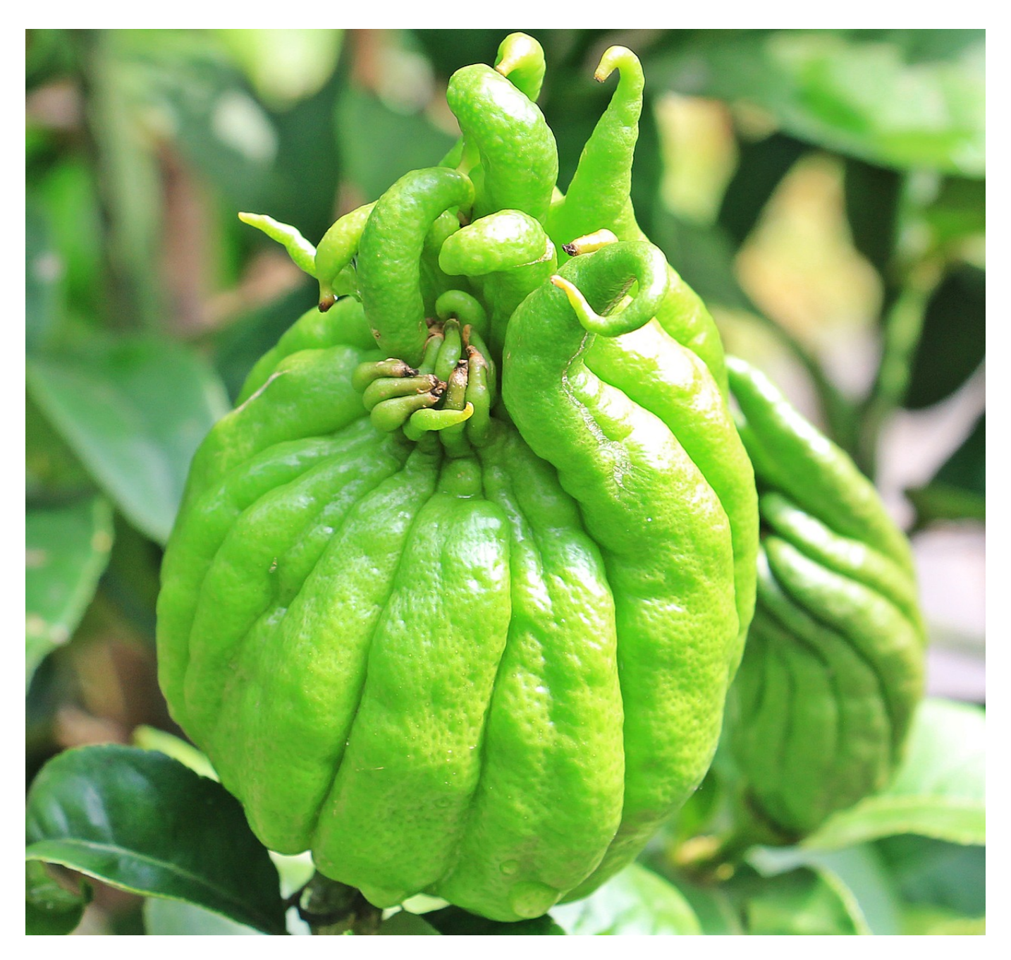
Synonyms of "Bitter" as a noun (1 Word)

bitterness A feeling of deep and bitter anger and ill-will. He expressed bitterness over his dismissal without notice.