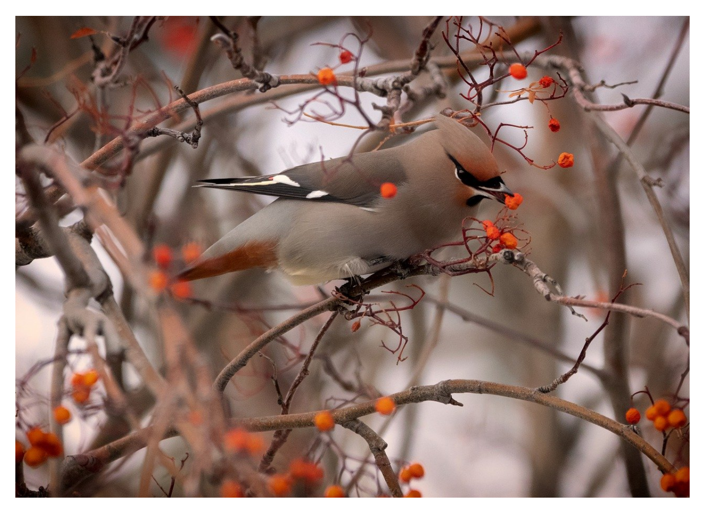
Usage Examples of "Bohemian" as a noun

• Warhol and the artists and bohemians he worked with in the 1960s.