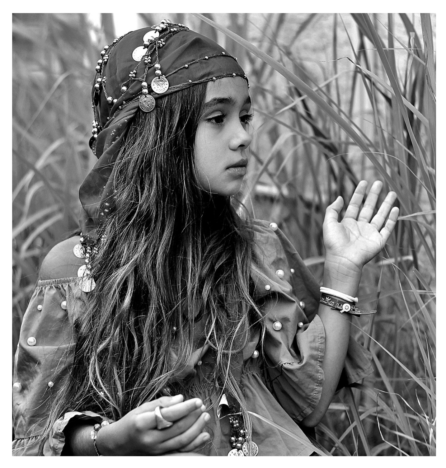
Synonyms of "Bohemian" as an adjective (12 Words)

alternative (of one or more things) available as another possibility or choice. An alternative plan.