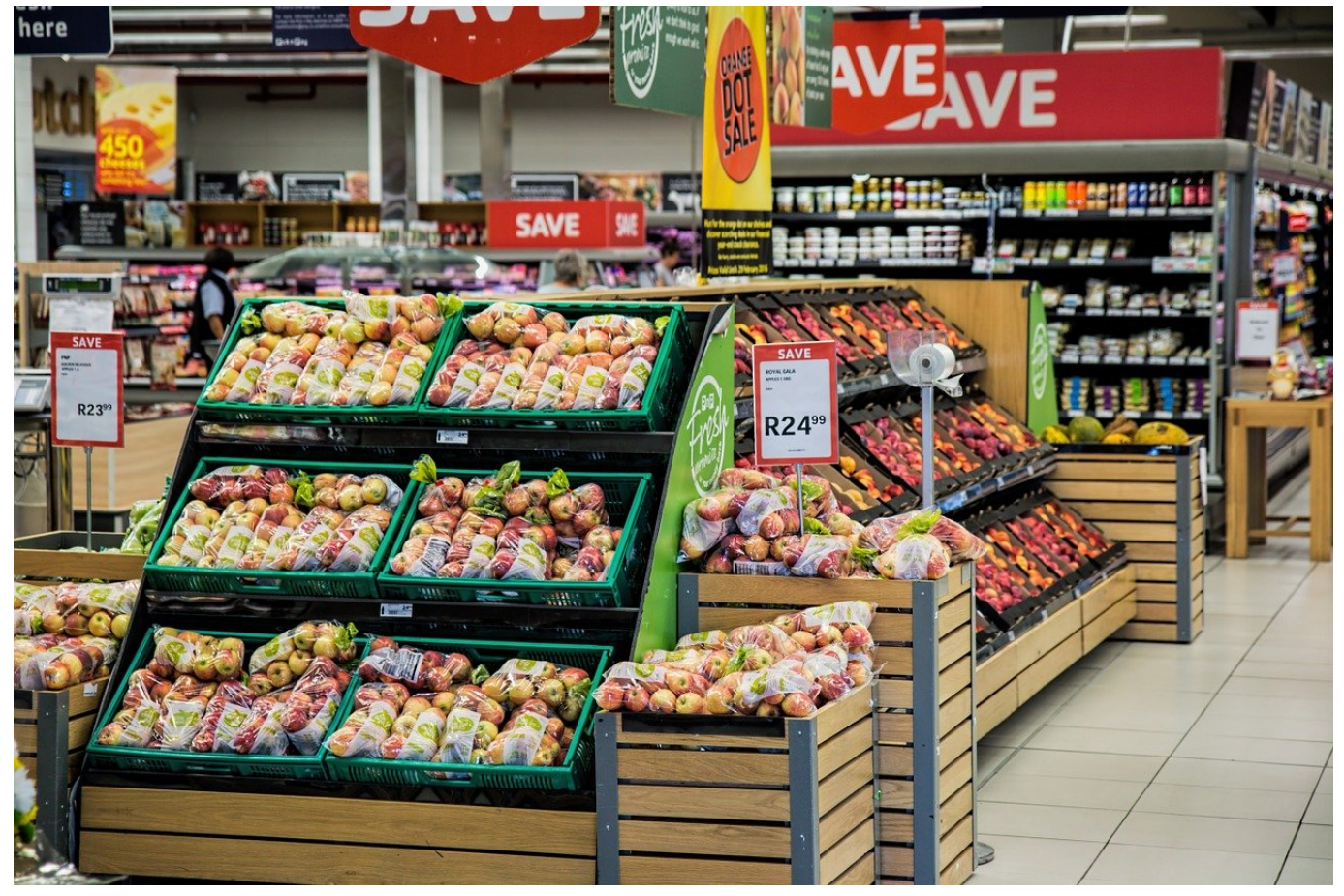
trade name The commercial exchange (buying and selling on domestic or international markets) of goods and services.