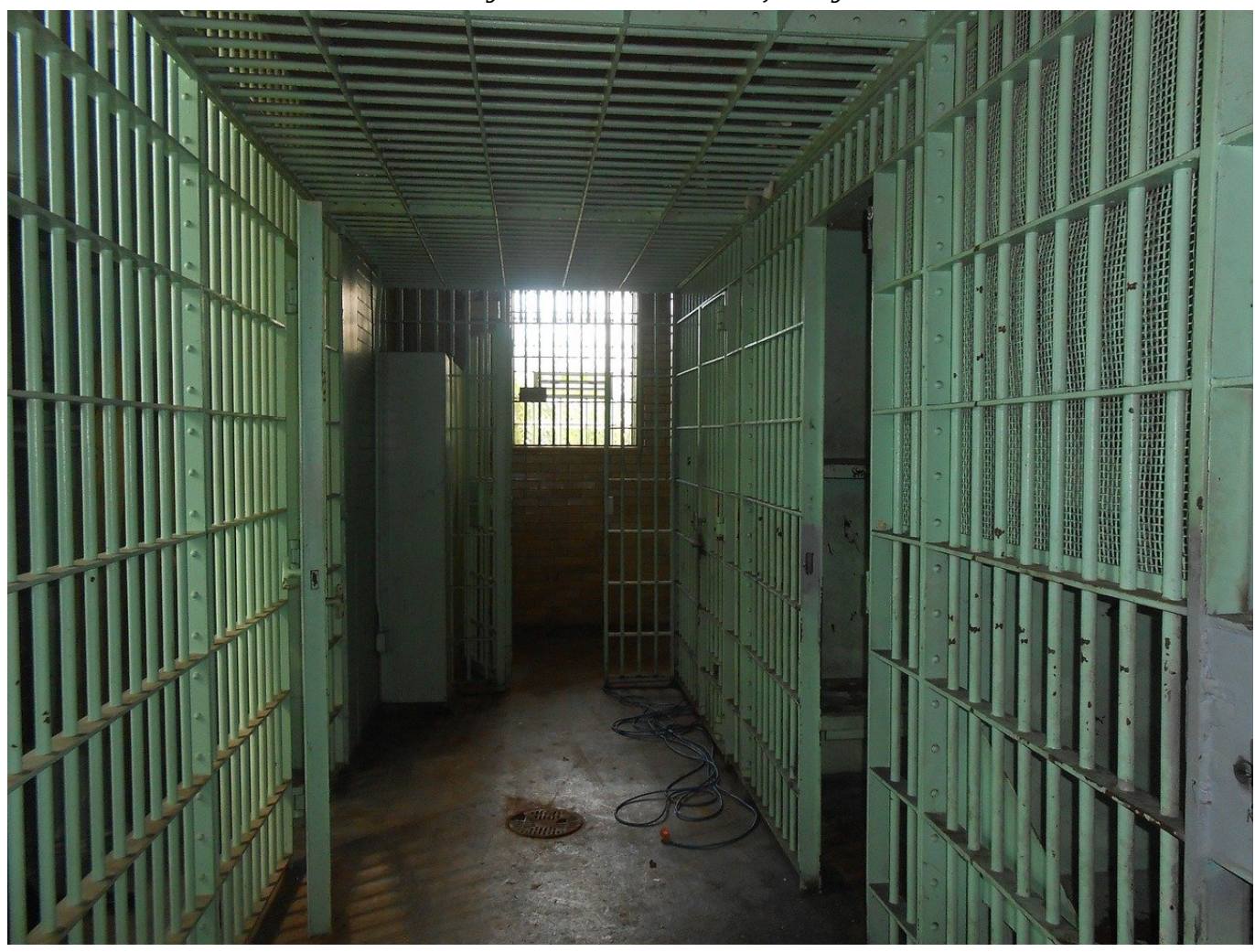
Bunk as a Verb

<u>rot</u> It was when they moved back to the family home that the rot set in.