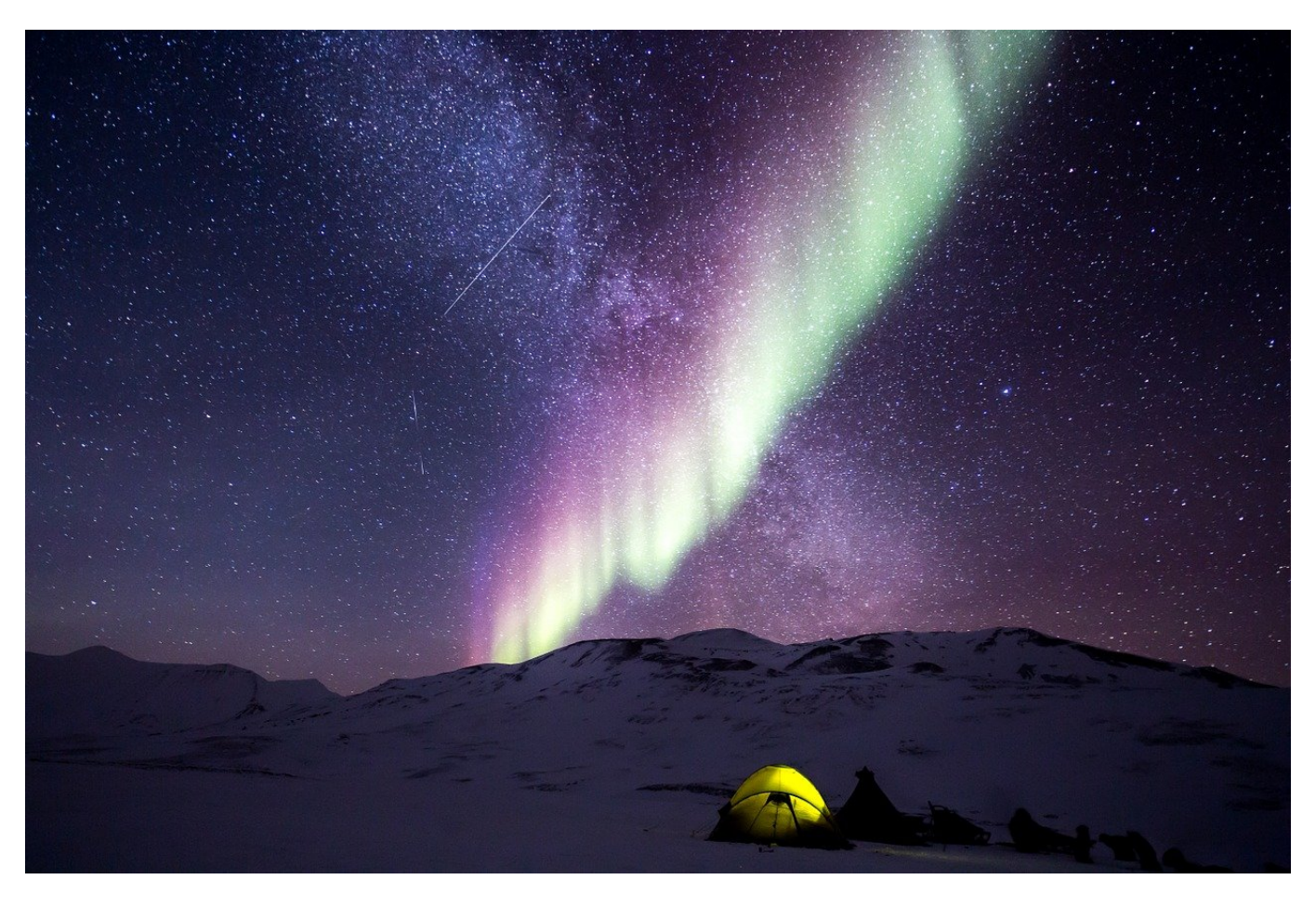
Synonyms of "Camp" as an adjective (1 Word)

Providing sophisticated amusement by virtue of having artificially (and vulgarly) {f campy} mannered or banal or sentimental qualities.