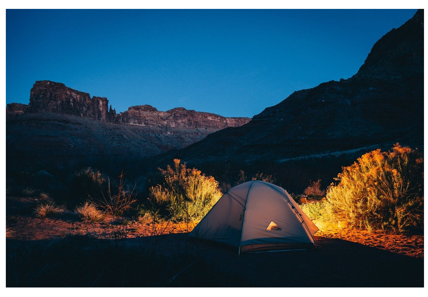
Synonyms of "Camp" as a noun (22 Words)