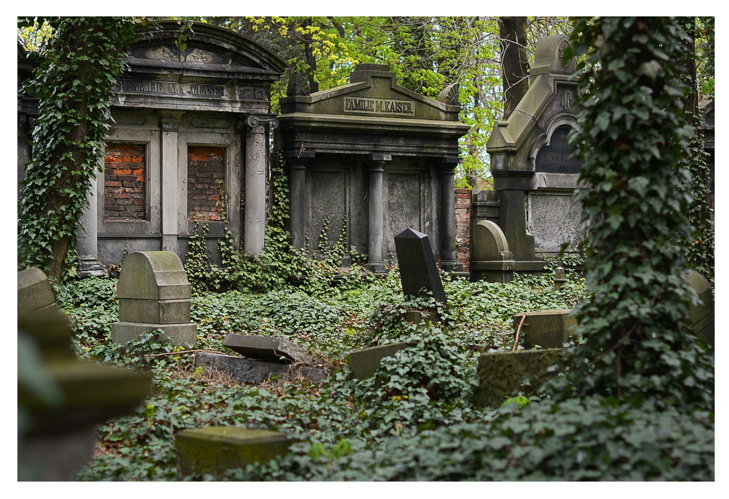
Usage Examples of "Cemetery" as a noun