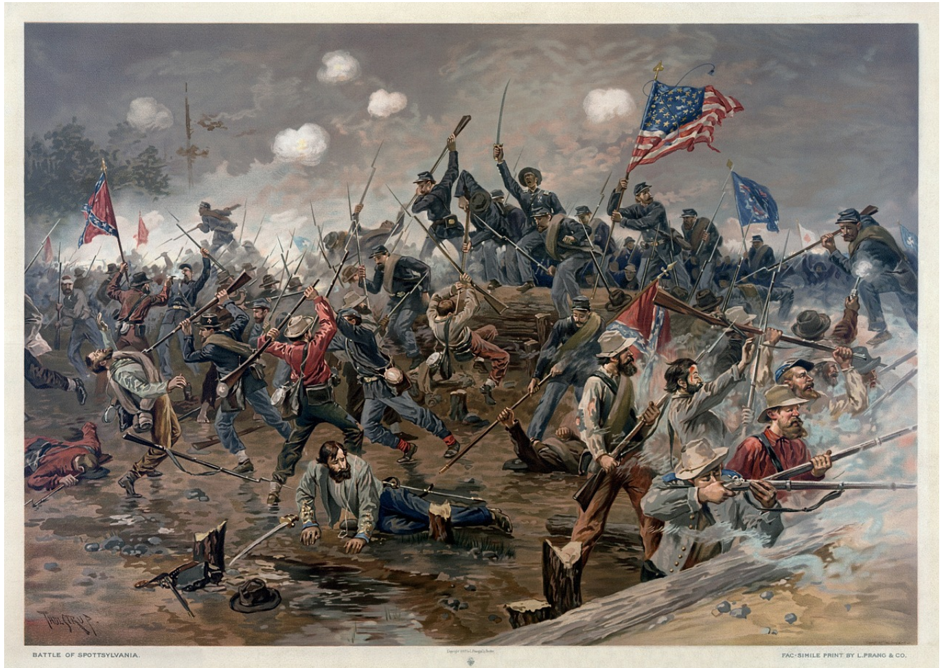
BATTLE OF SPOTSYLVANIA.