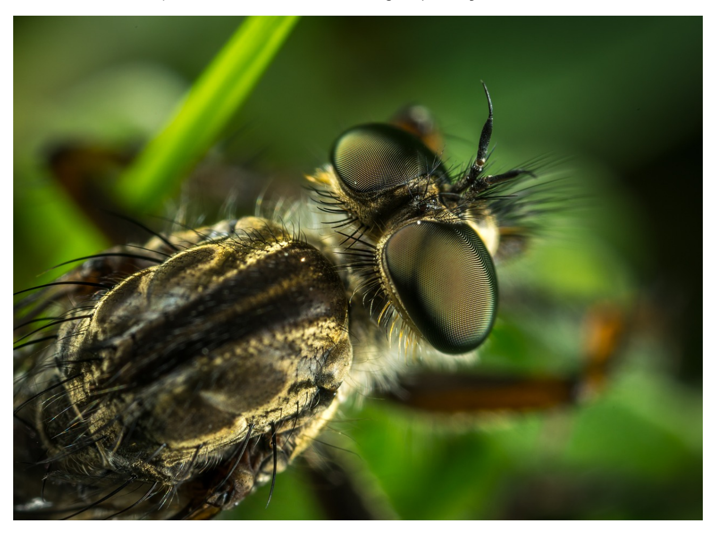
Synonyms of "Compound" as a noun (13 Words)