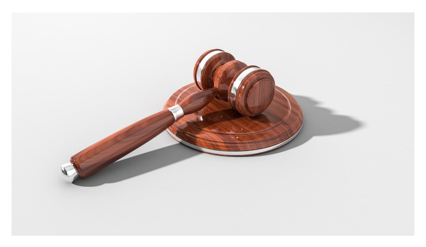
Usage Examples of "Constitutional" as a noun