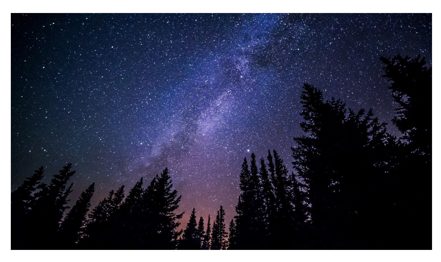
Synonyms of "Cosmic" as an adjective (2 Words)

extraterrestrial Of or from outside the earth or its atmosphere. Searches for extraterrestrial intelligence.