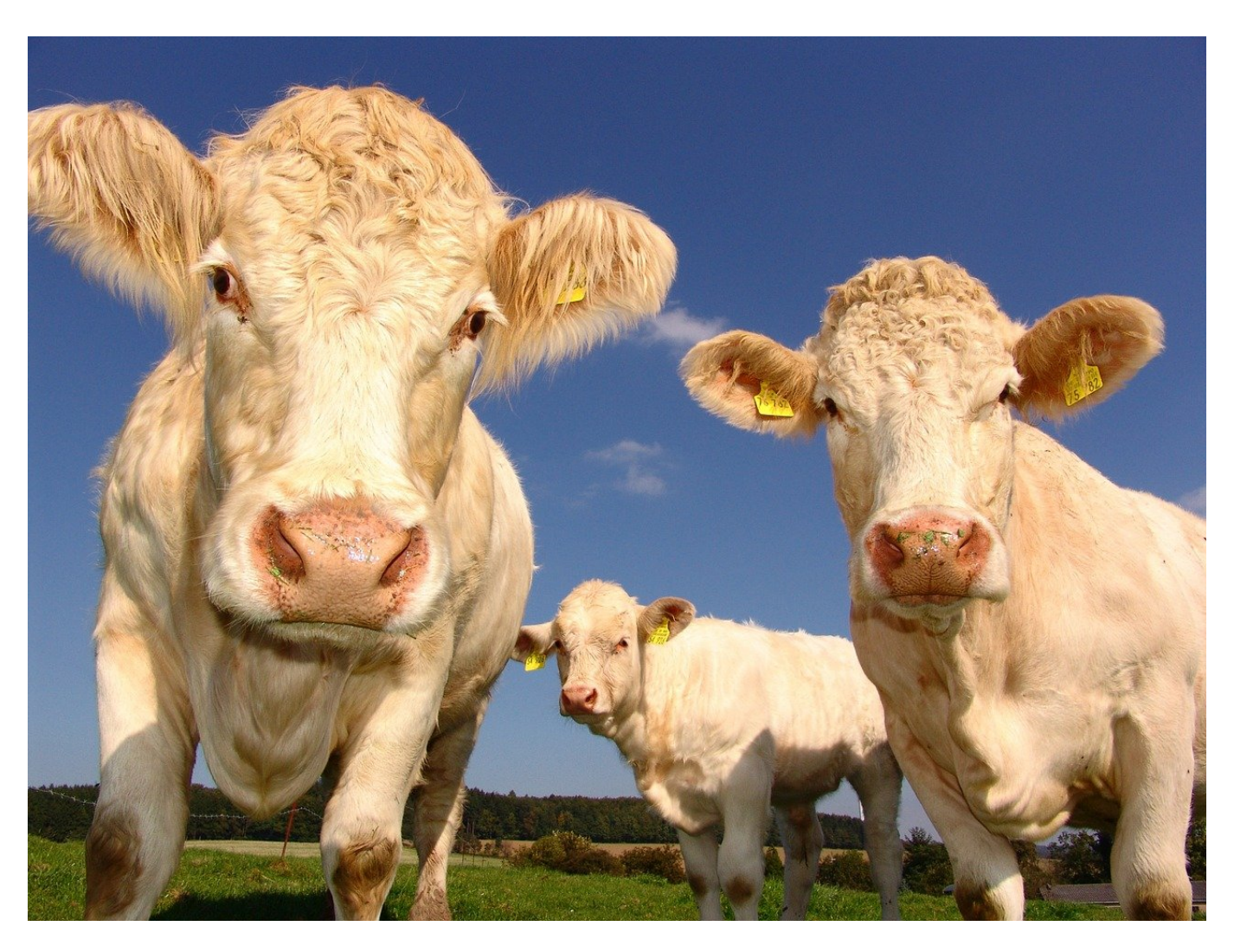
Synonyms of "Cow" as a verb (1 Word)

Subdue, restrain, or overcome by affecting with a feeling of awe; frighten (as with {f overawe} threats.