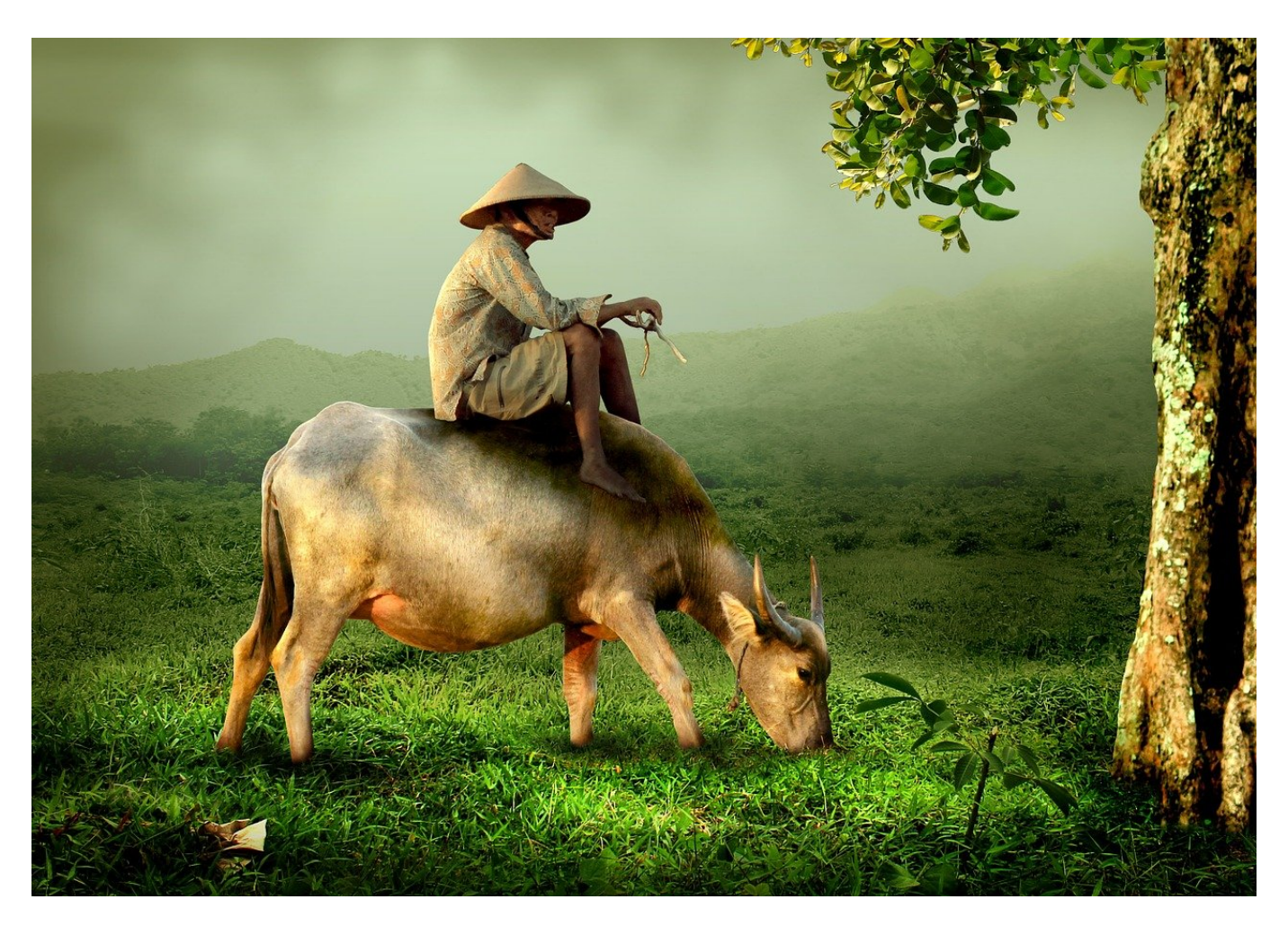
Synonyms of "Cow" as a noun (1 Word)