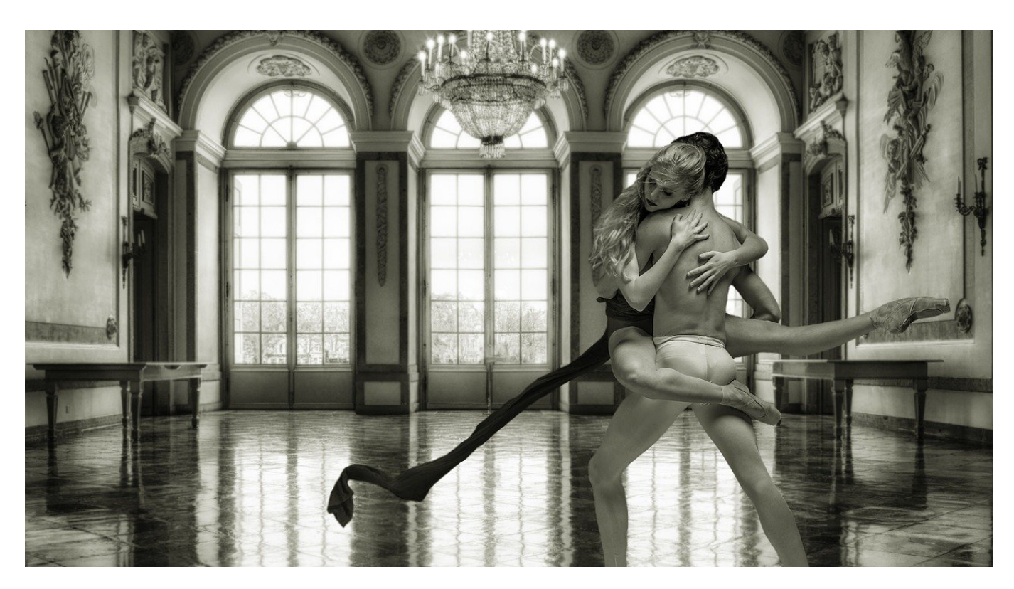
Synonyms of "Dances" as a verb (2 Words)

trip the light fantastic Get high, stoned, or drugged.trip the light fantastic toe Miss a step and fall or nearly fall.