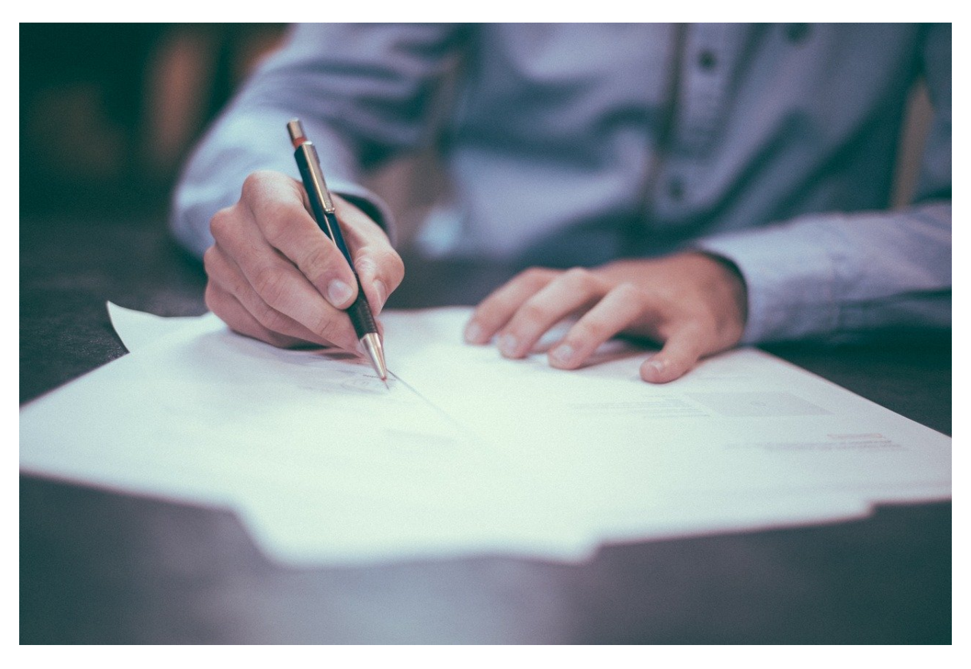
Synonyms of "Documented" as an adjective (2 Words)

attested Established as genuine.authenticated Established as genuine.