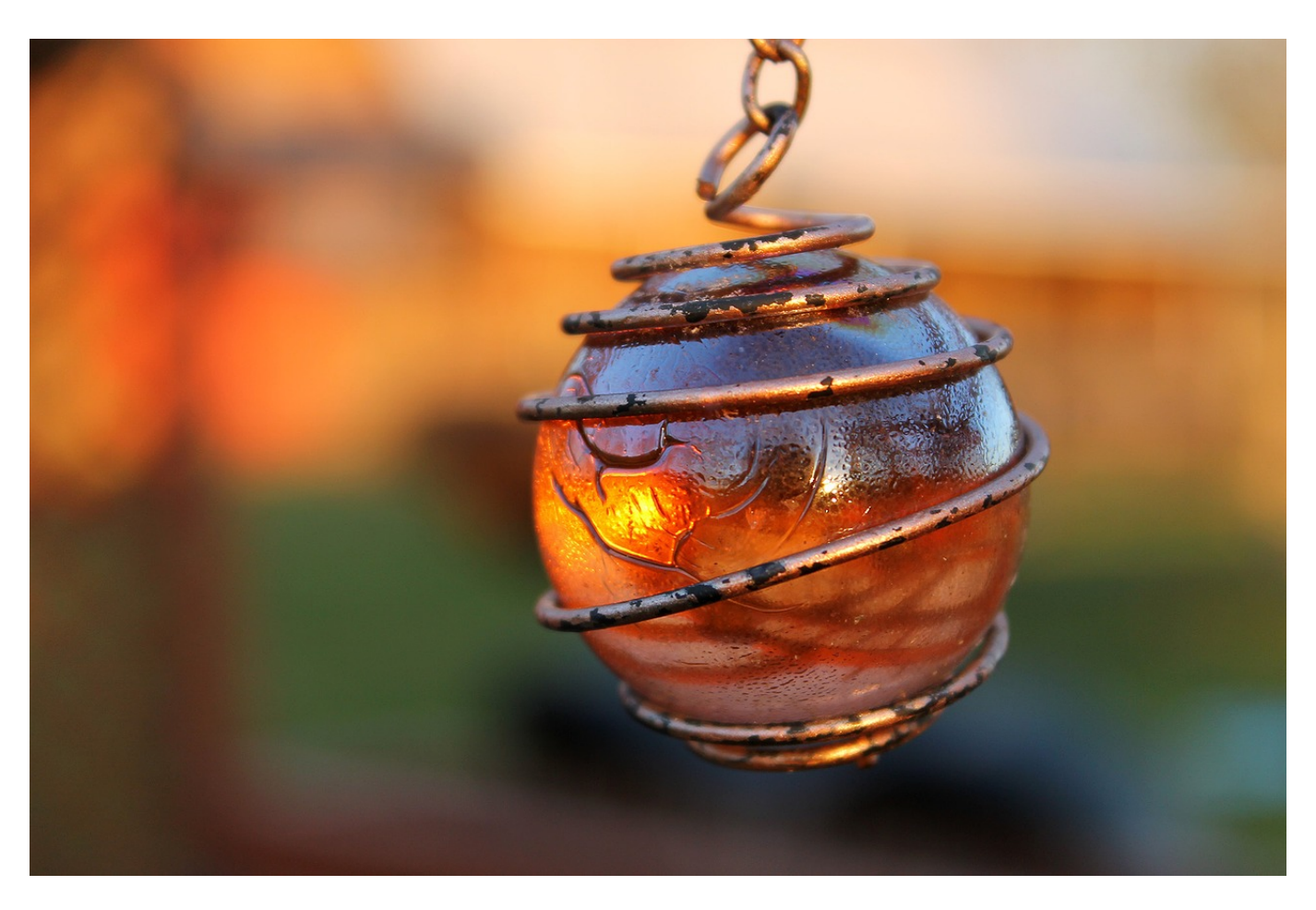
Synonyms of "Encased" as an adjective (2 Words)

cased Covered or protected with or as if with a case. Products encased in leatherette.