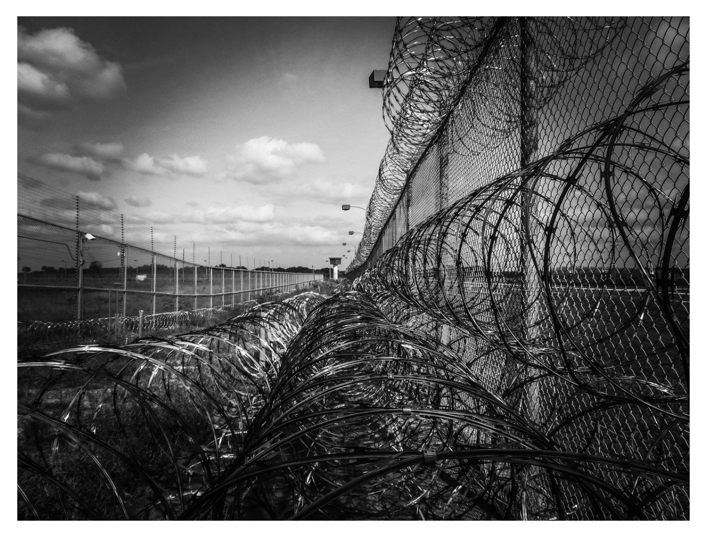
Synonyms of "Enforcer" as a noun (1 Word)

hatchet man Weapon consisting of a fighting ax; used by North American Indians.