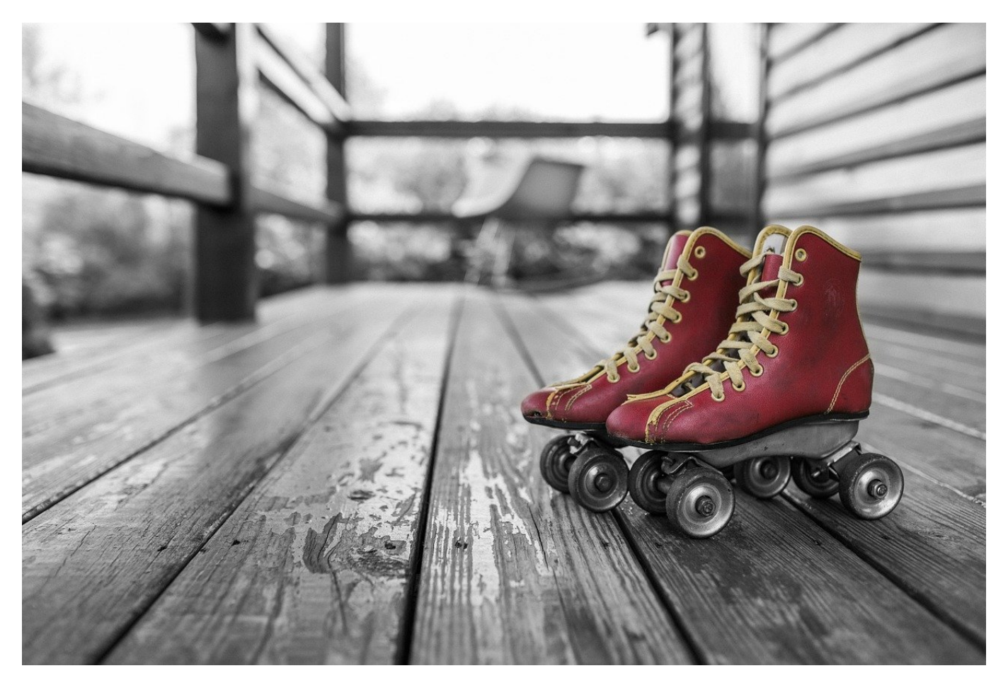
Usage Examples of "Exercising" as a noun