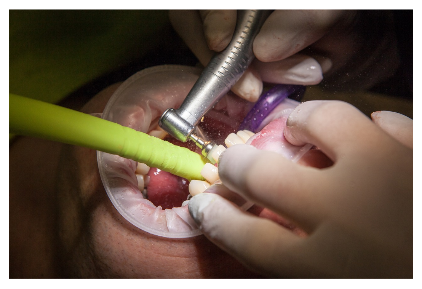
Synonyms of "Facets" as a noun (1 Word)

\mathbf{aspect} \overset{\mathsf{The \ feelings \ expressed \ on \ a \ person's \ face.}}{A \ greenhouse \ with \ a \ southern \ \boldsymbol{aspect}}.