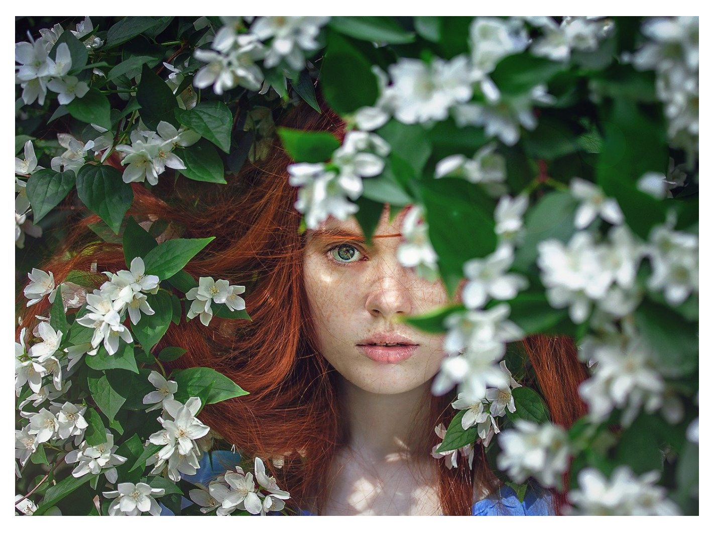
Synonyms of "Facing" as an adjective (1 Word)

\begin{array}{c} \textbf{opposing} \\ \textbf{Opponent or opposing } \\ \textbf{armies.} \end{array}