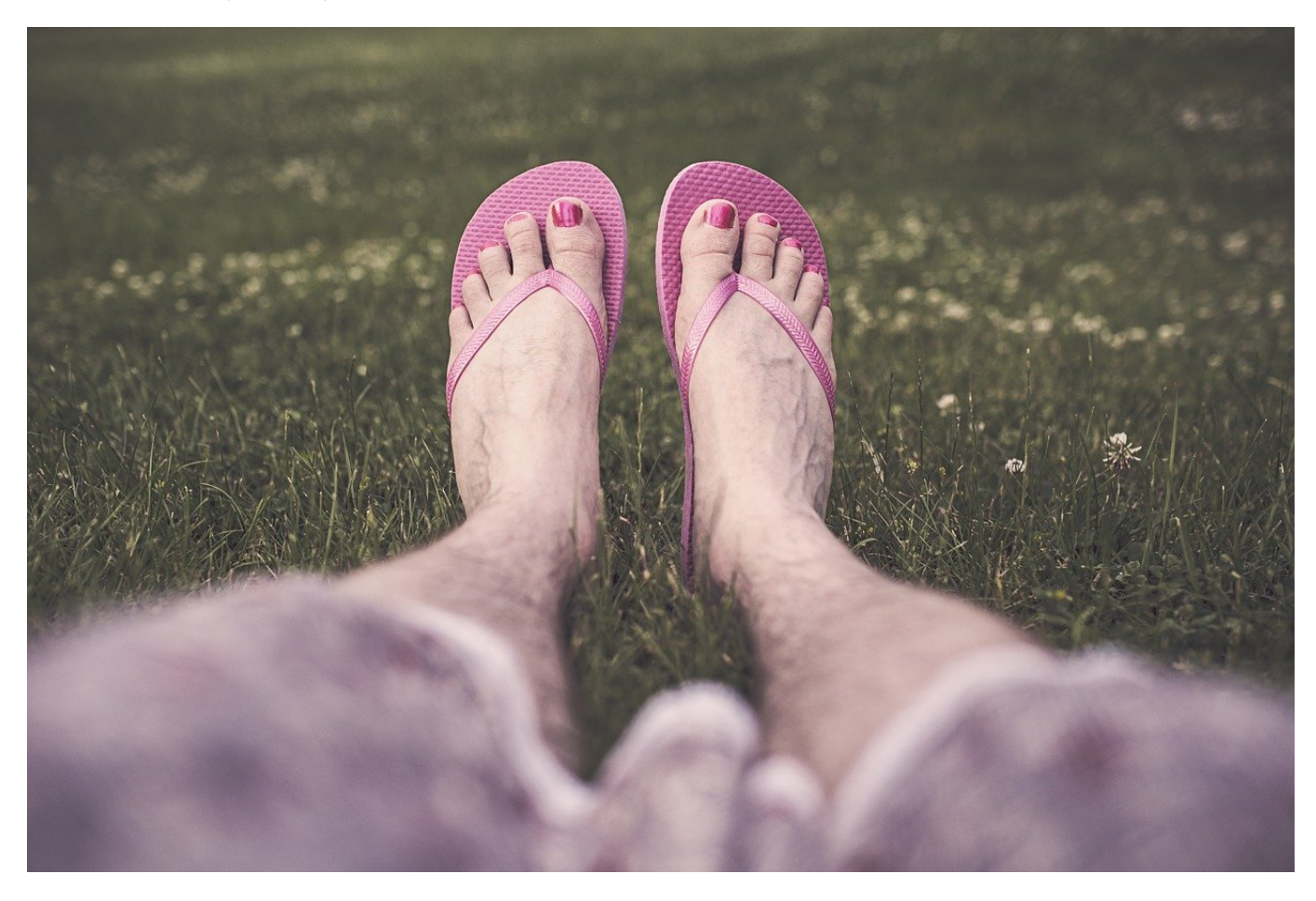
Synonyms of "Flip" as a verb (44 Words)