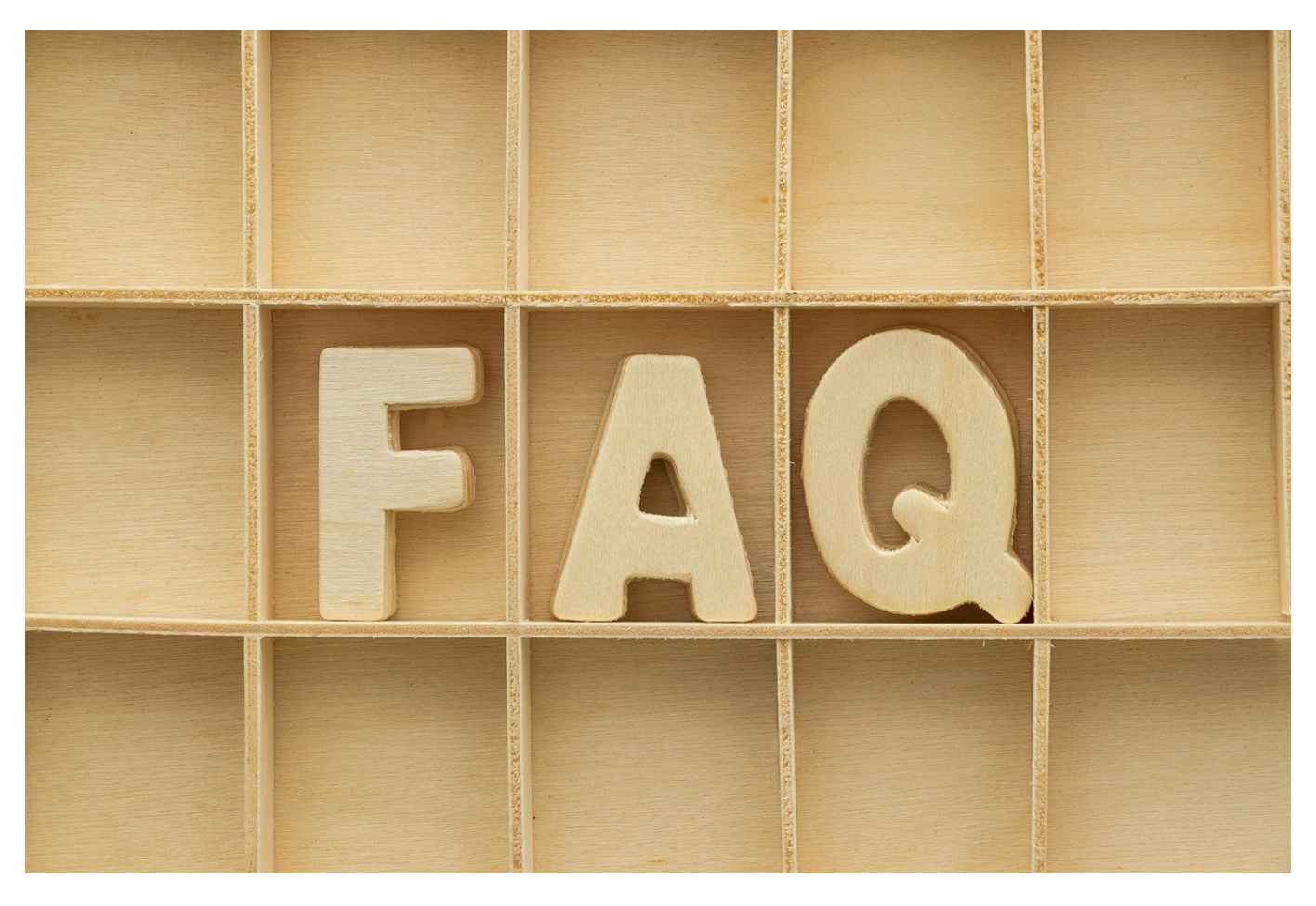
Usage Examples of "Frequently" as an adverb