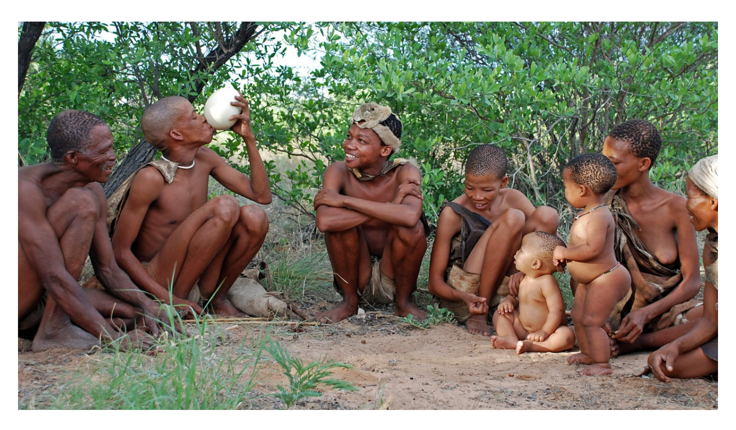
Synonyms of "Gather" as a noun (1 Word)