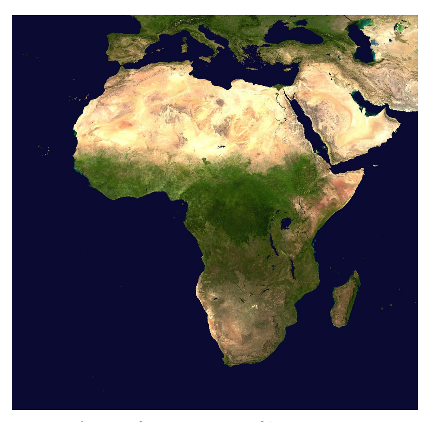
Synonyms of "Geography" as a noun (6 Words)

An orderly grouping (of things or persons) considered as a unit; the result of arrangement arranging.