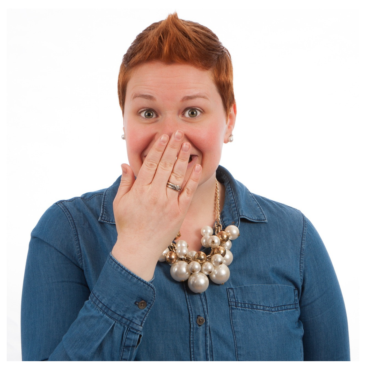
Synonyms of "Giggle" as a noun (6 Words)

chortle A soft partly suppressed laugh. Thomas gave a chortle .