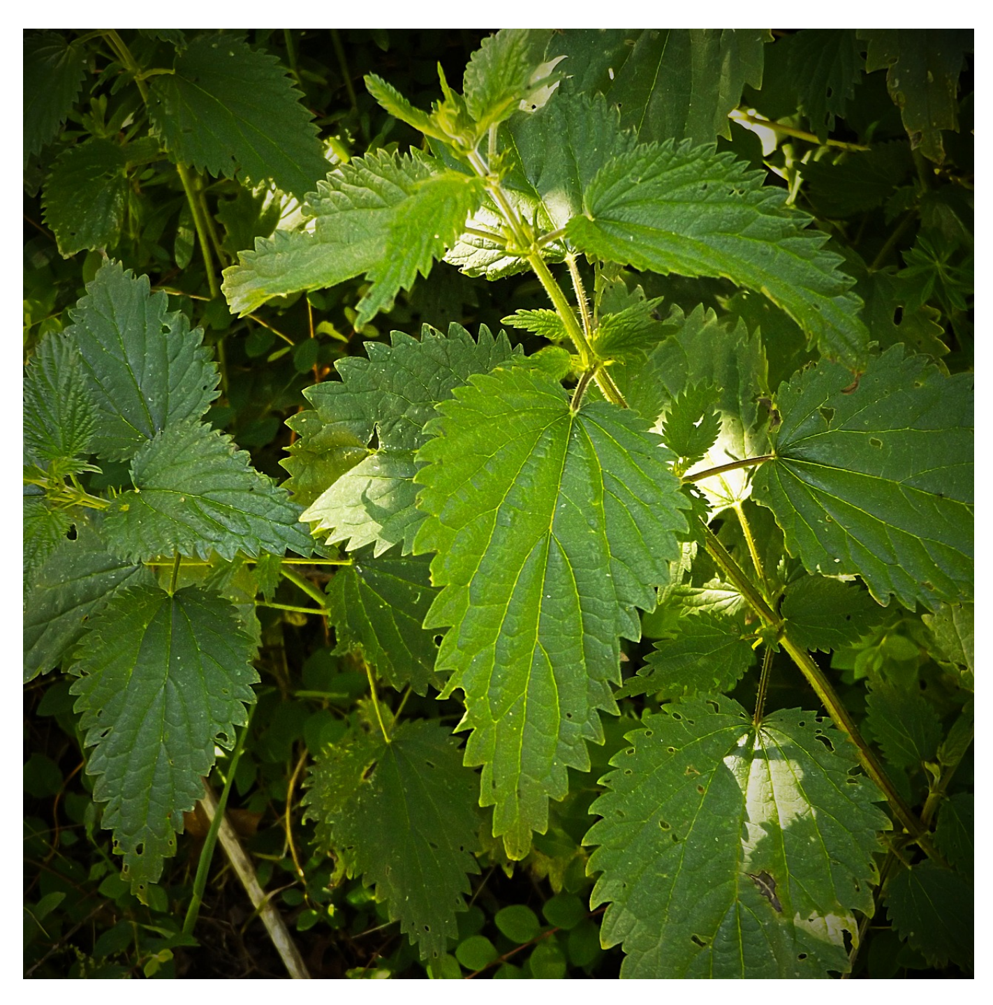
Synonyms of "Healer" as a noun (1 Word)

\frac{\textbf{therapist}}{\textit{Cost is one factor keeping them from the } \textbf{therapist}} \\ s couch.