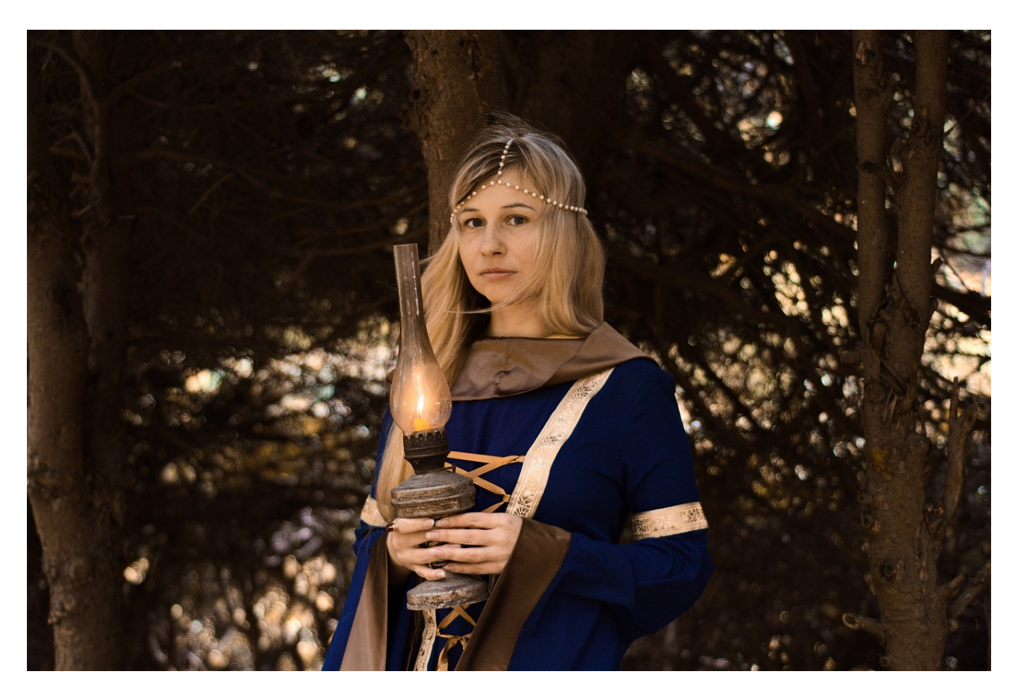
Usage Examples of "Heathen" as an adjective