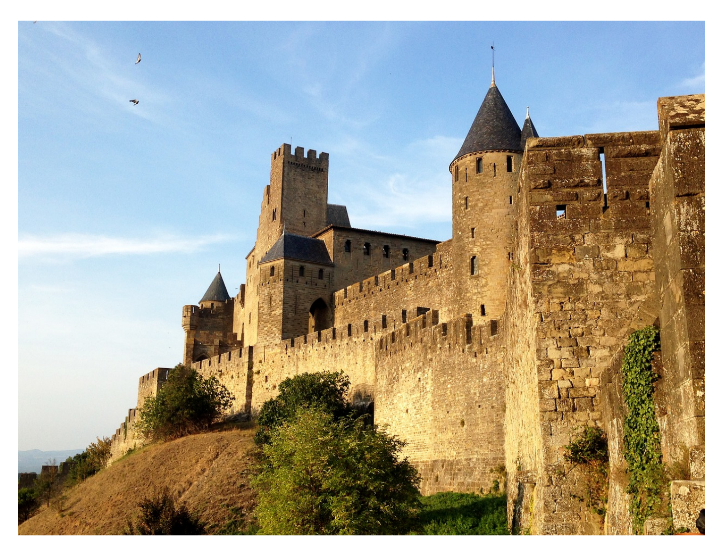
Usage Examples of "Historian" as a noun