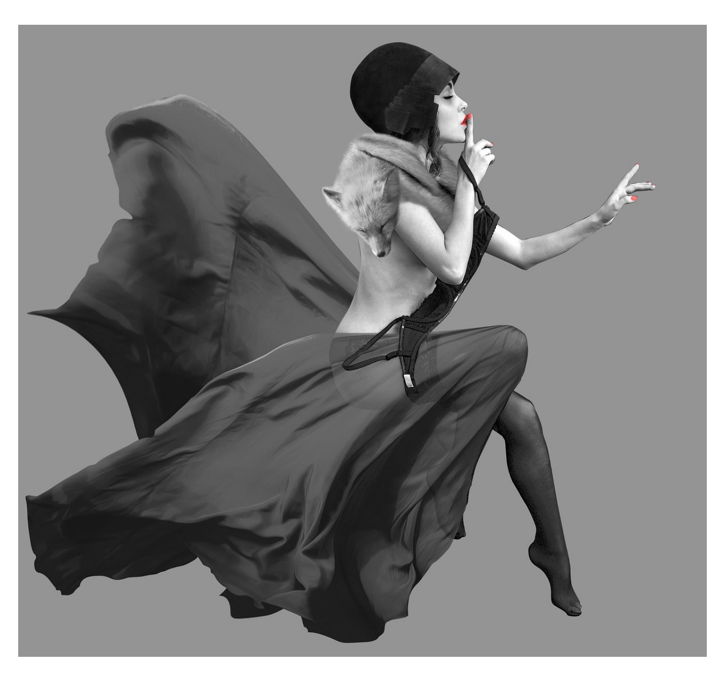
Usage Examples of "Hush" as a noun