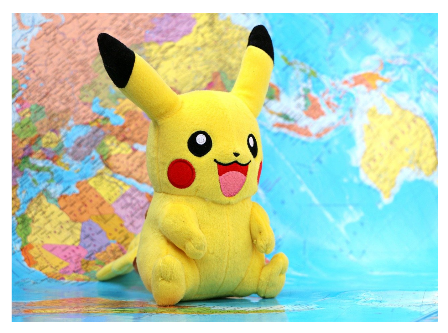
Usage Examples of "Idol" as a noun