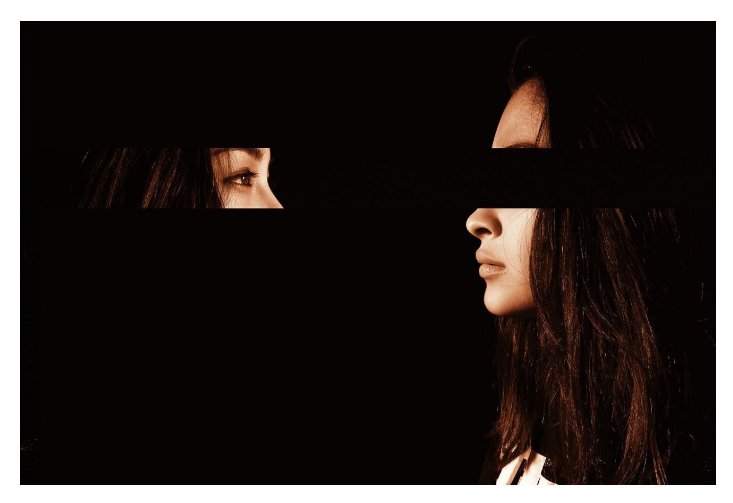
Usage Examples of "Inferior" as a noun

• Her social and intellectual inferiors.