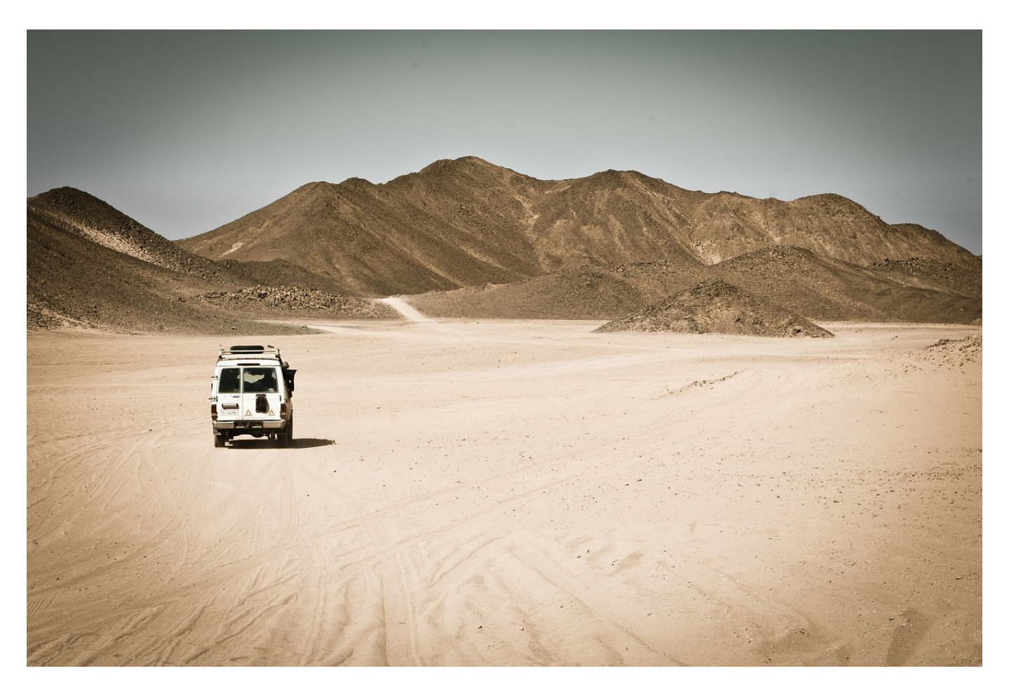
Synonyms of "Infinite" as a noun (1 Word)

\mathbf{space} \ \ \frac{\text{One of the areas between or below or above the lines of a musical staff.}}{\textit{She had a love of open } \mathbf{space}s.}