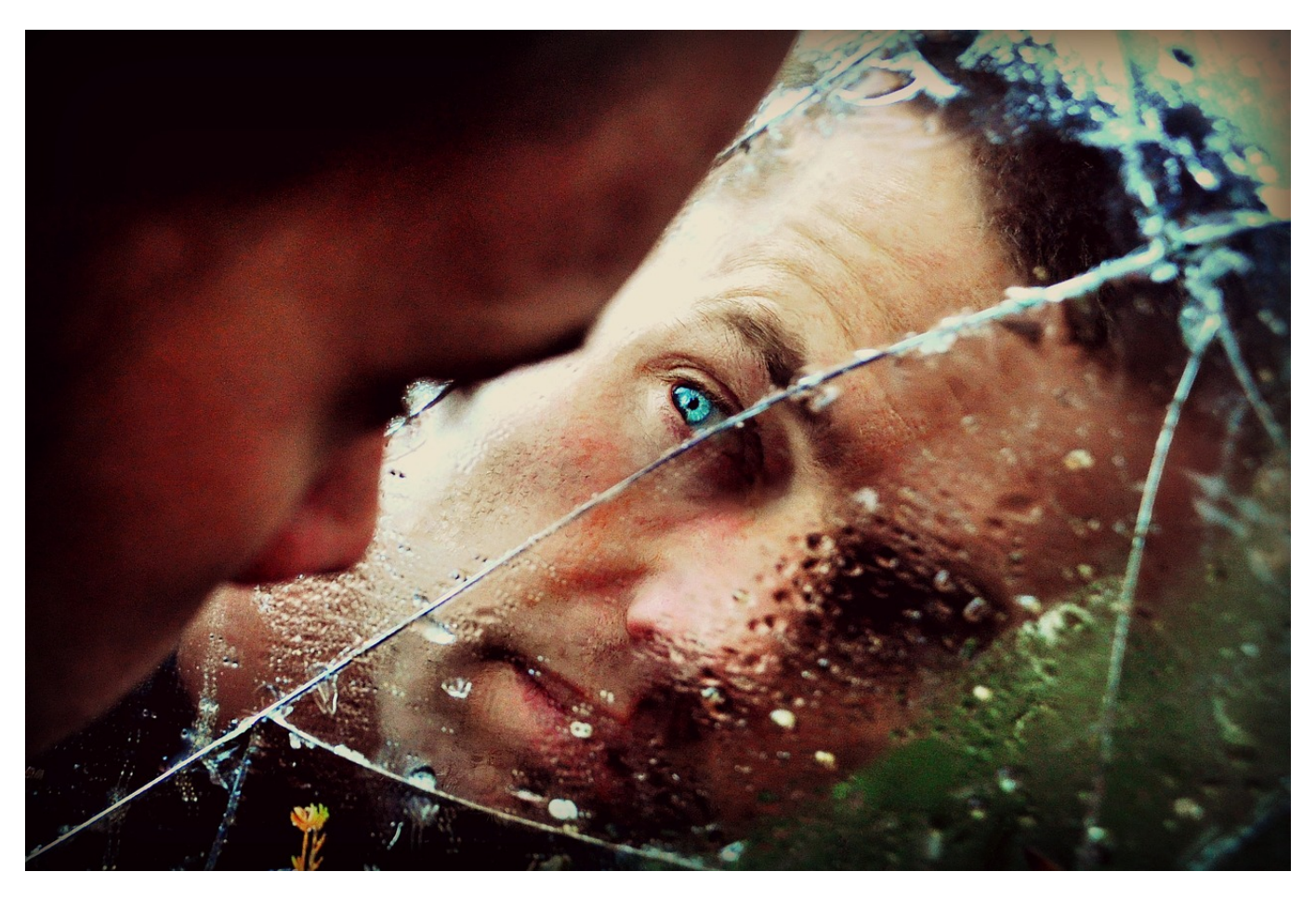
Usage Examples of "Introspection" as a noun

• Quiet introspection can be extremely valuable.