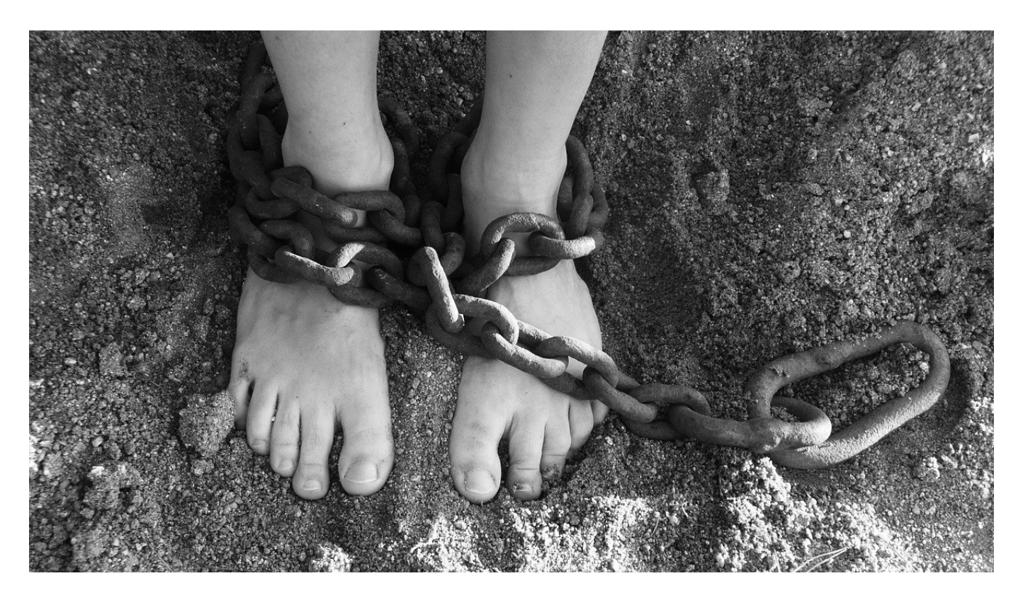
Usage Examples of "Kidnap" as a noun

• They were arrested for robbery and kidnap.