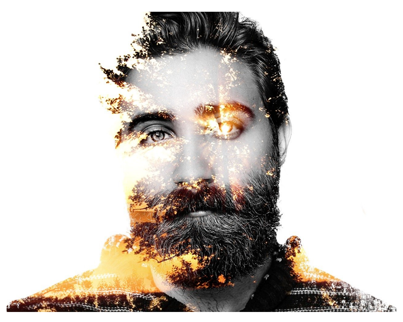
Synonyms of "Melancholic" as a noun (1 Word)

\begin{tabular}{ll} \textbf{melancholiac} & A person suffering from melancholia or depression. \\ Ovid s portrayal of Sappho as a desolate $\textit{melancholiac}$. \end{tabular}