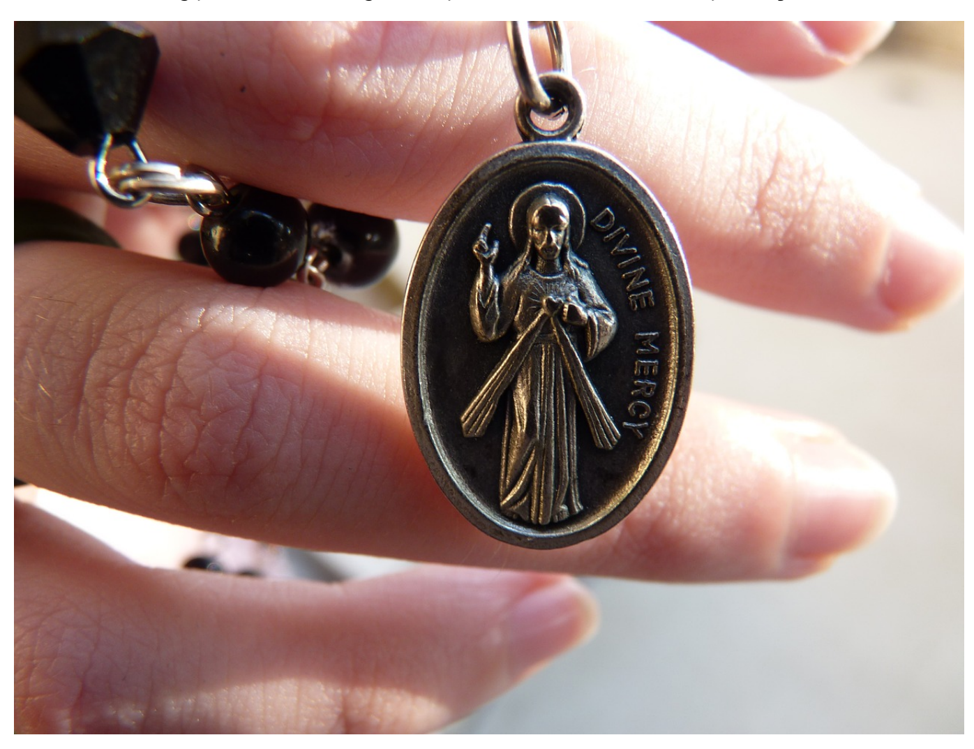
Associations of "Mercy" (30 Words)