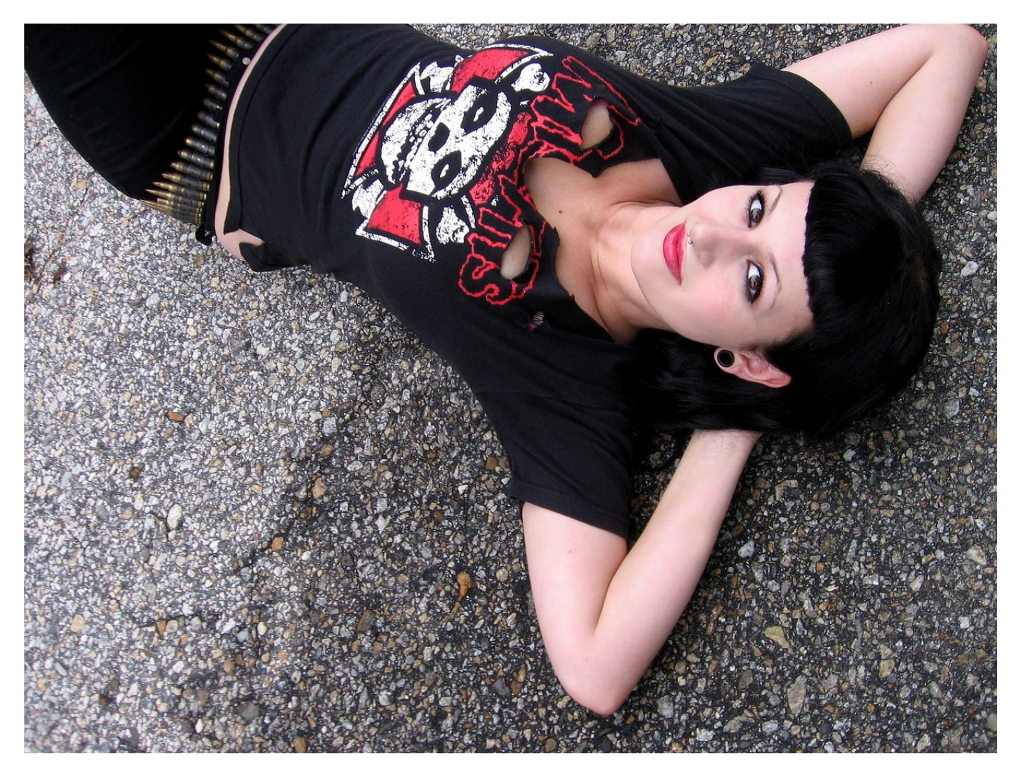
Synonyms of "Misfit" as a noun (3 Words)

fish out of water The flesh of fish used as food. round peg in a square hole A regular route for a sentry or policeman. square peg in a round hole A formal and conservative person with old-fashioned views.