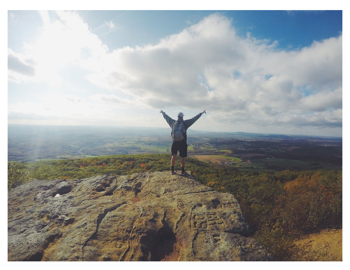
Usage Examples of "Motives" as a noun