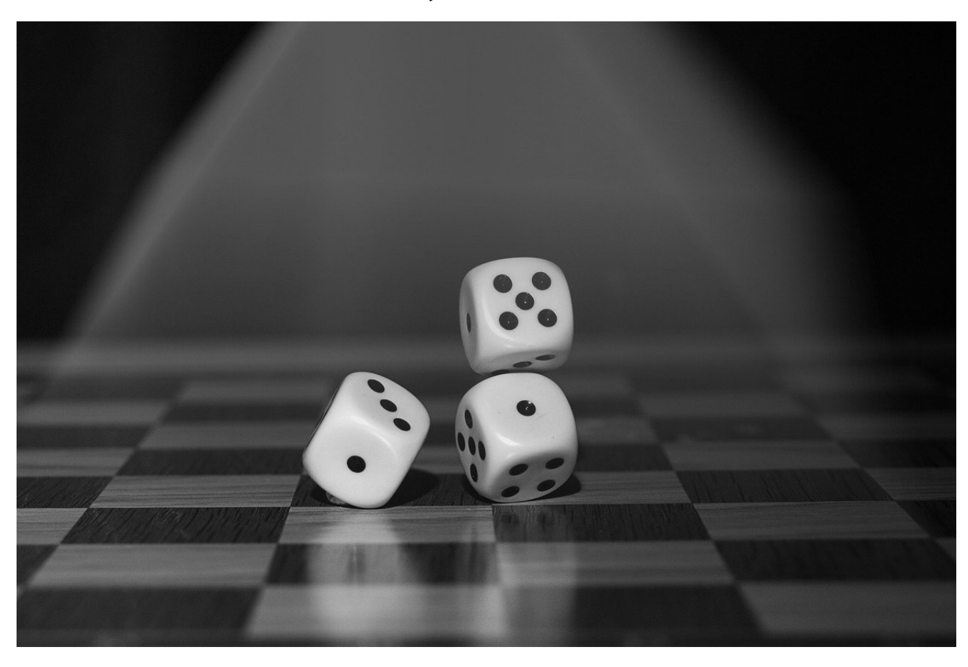
Synonyms of "Number" as a verb (22 Words)