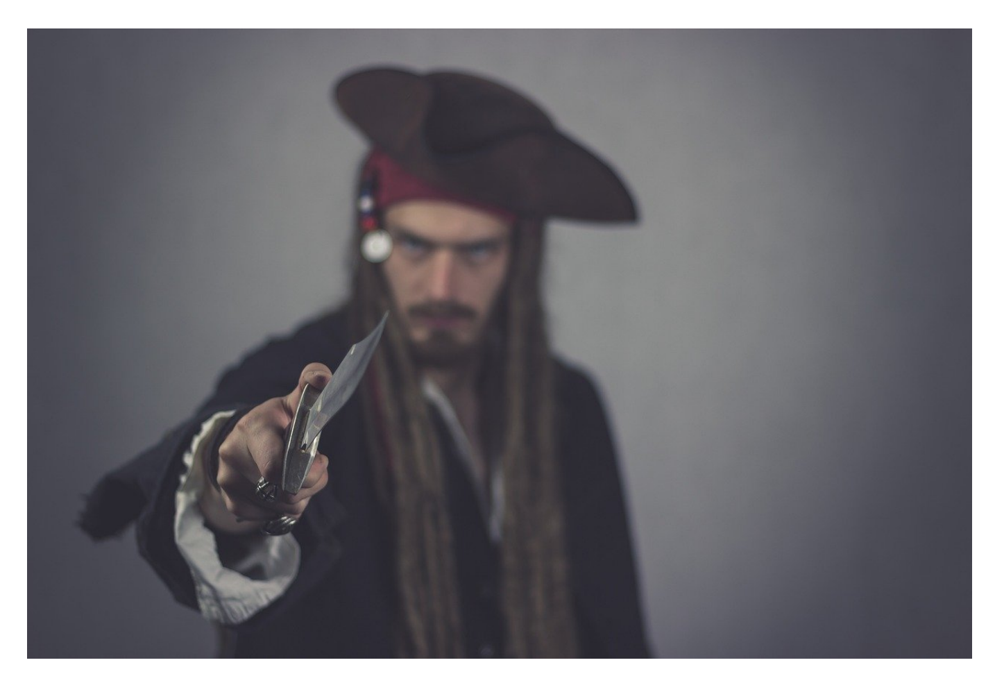
Usage Examples of "Outlaw" as an adjective