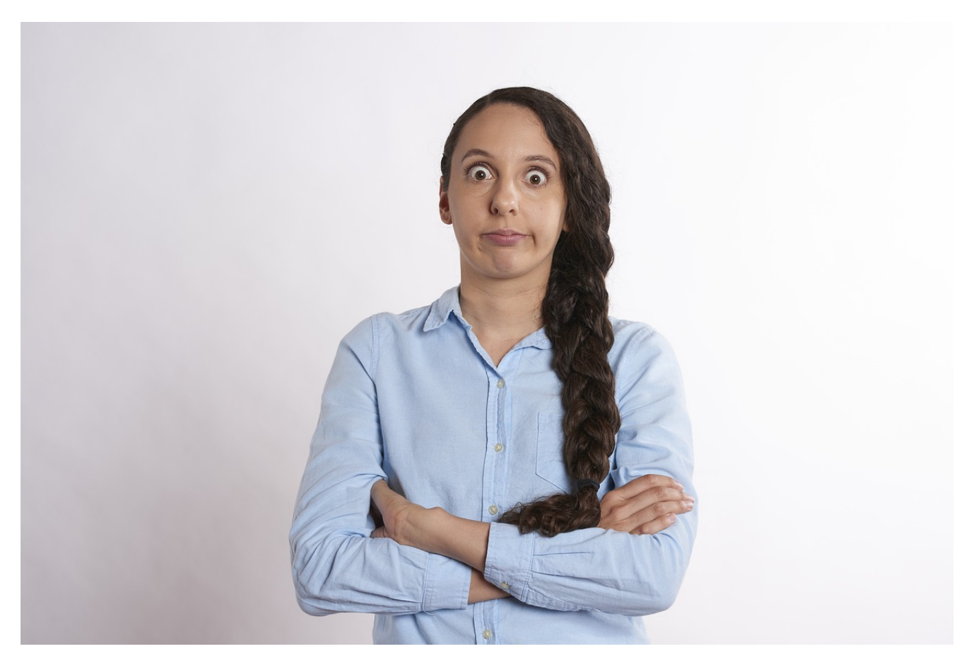
Synonyms of "Paranoid" as a noun (1 Word)