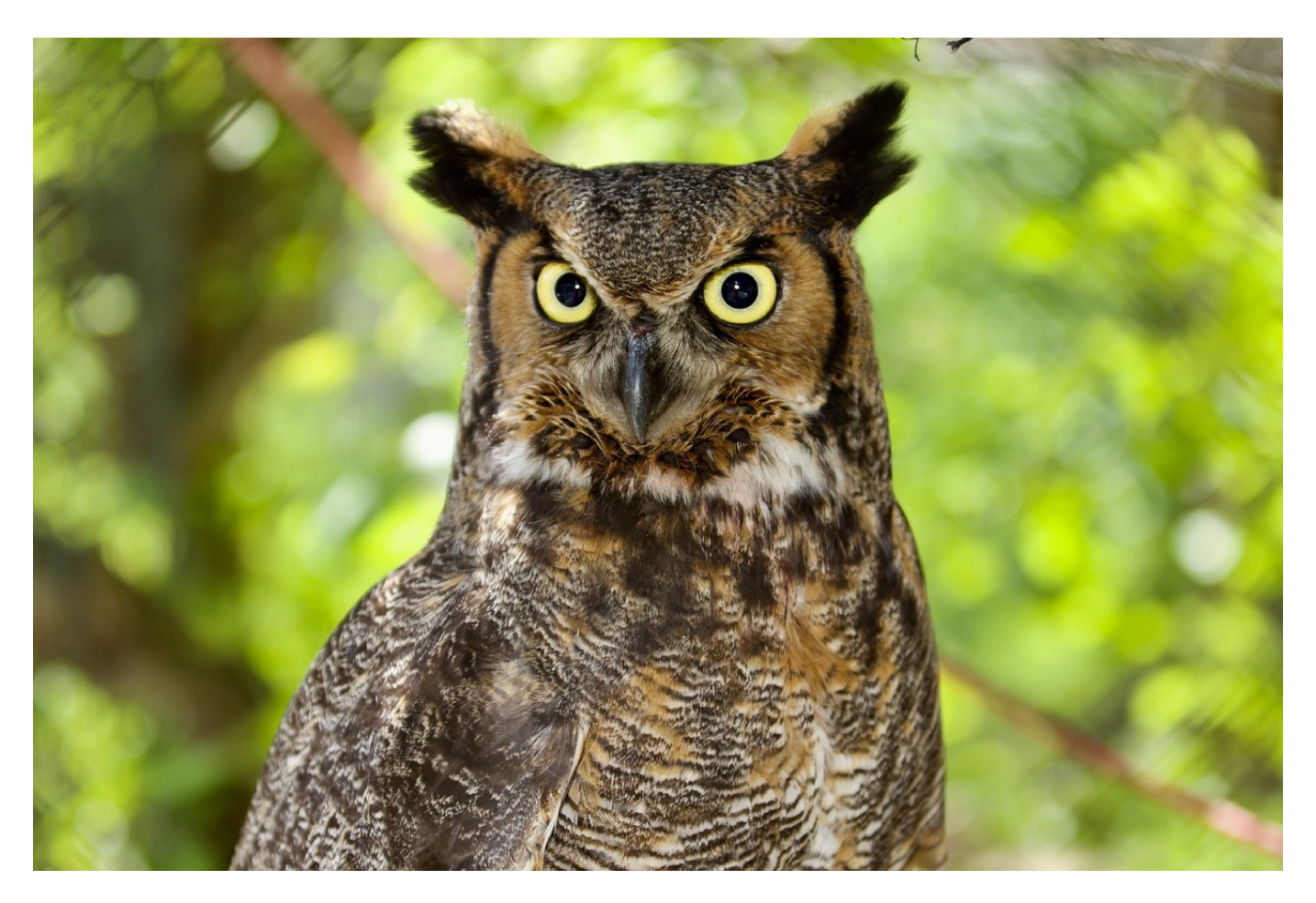
Usage Examples of "Paranoid" as a noun

• Further accusations would sound like the ramblings of a paranoid.