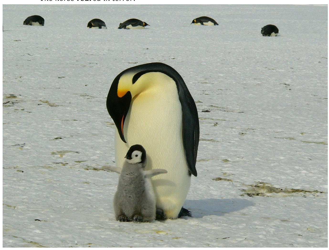
Associations of "Parents" (30 Words)