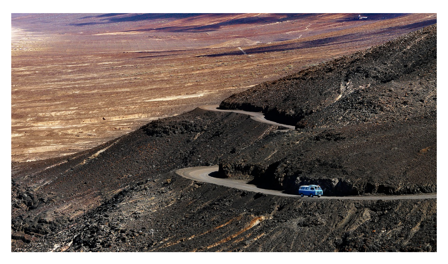
Usage Examples of "Precipice" as a noun

ullet We swerved toward the edge of the precipice.