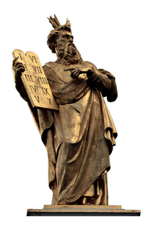
Synonyms of "Proclaimed" as an adjective (1 Word)

\begin{array}{c} \textbf{announced} \\ \textbf{Their announced} \end{array} \\ \begin{array}{c} \textbf{Declared publicly; made widely known.} \\ \end{array}