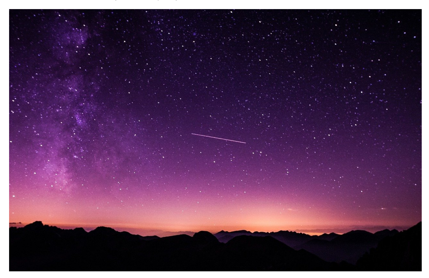
Synonyms of "Purple" as a noun (2 Words)

purpleness A purple color or pigment.the purple Of imperial status.