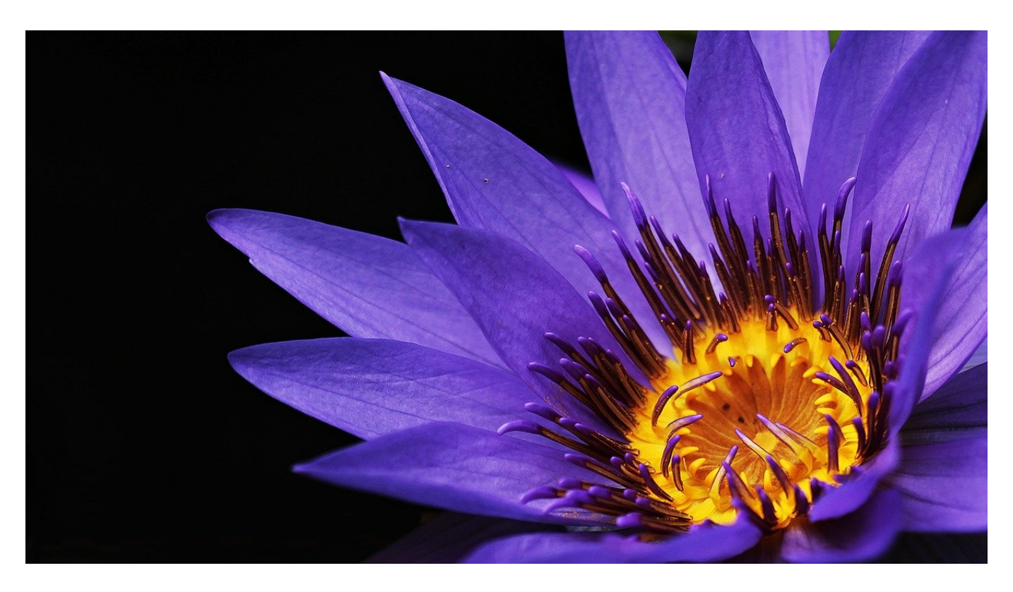
Synonyms of "Purple" as a verb (2 Words)

empurple Make or become purple. His face empurpled with fury.