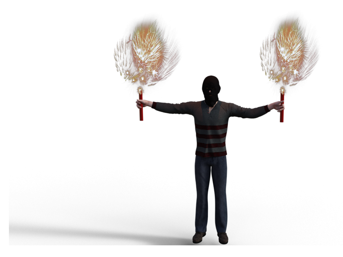
Usage Examples of "Rampage" as a noun

• Youths went on the rampage and wrecked a classroom.